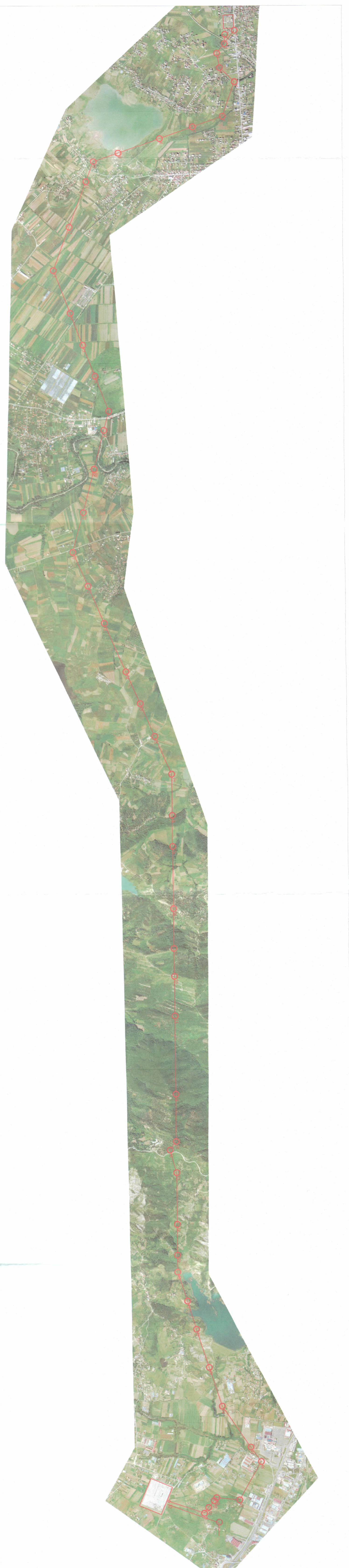
PLANI 1 VENDOSIES SË STRUKTURËS LINJA 400/220 KV TIRANA 2 - RRASHBULL SHK. 1: 5000