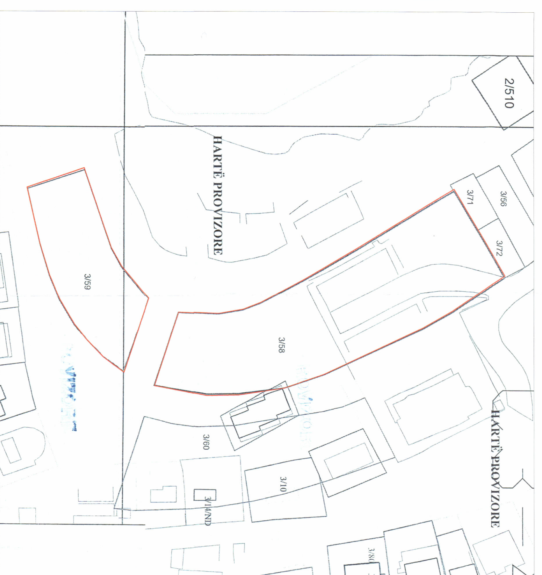
PLANI I VENDOSJES SË STRUKTURËS SHK. 1: 350